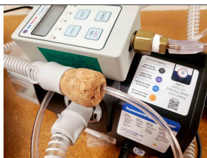
Simple Adapter Connections