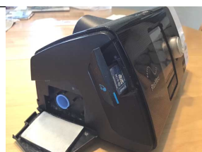
Doors for filter and SD card are delicate and sometimes hard to open.