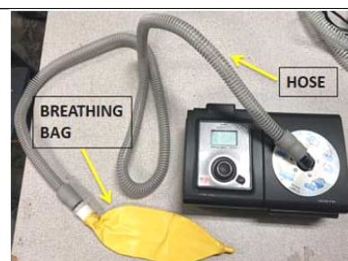
Disposable Breathing Bag, 1 L, $7.50